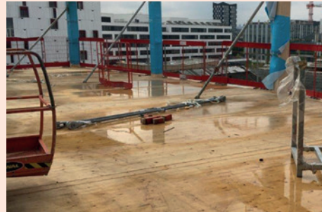
Building damage through wetness